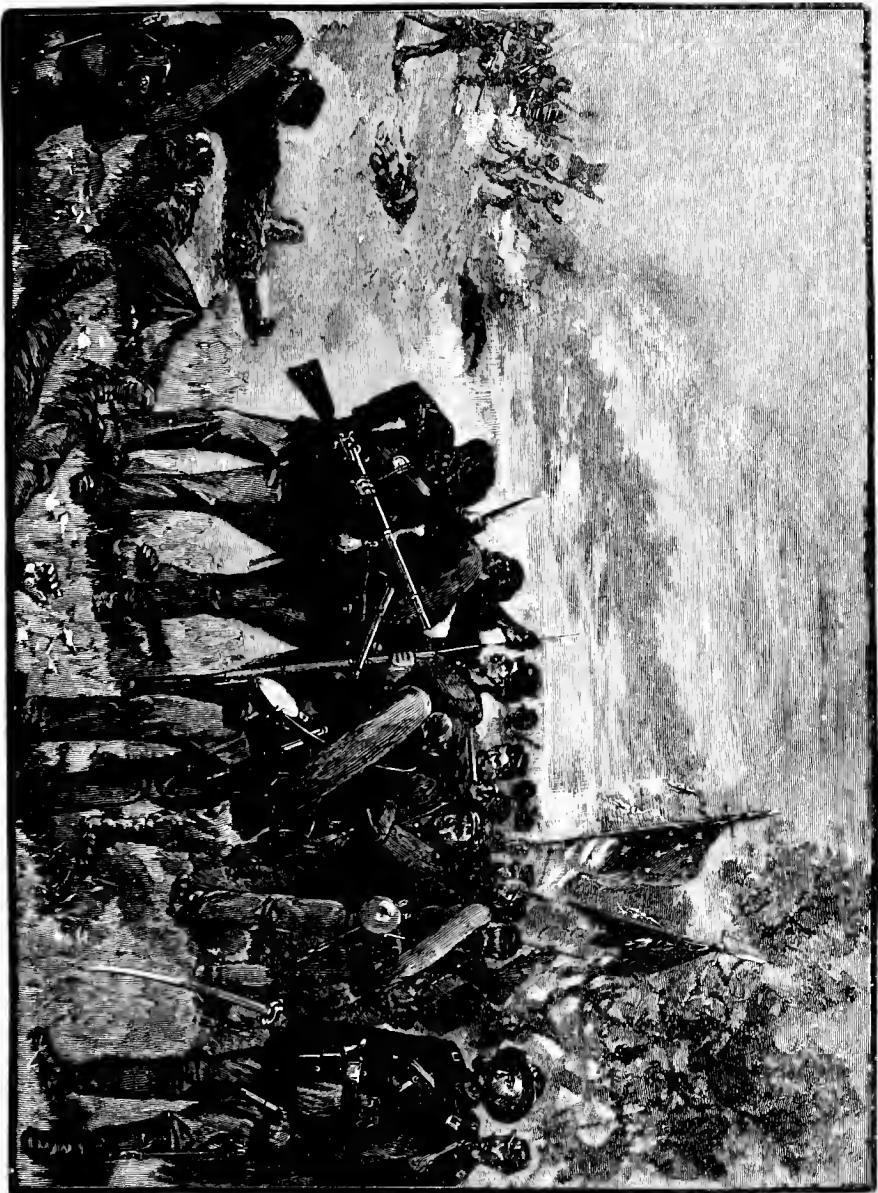
AT CLOSE QUARTERS THE FIRST DAY AT CHICKAMAUGA.