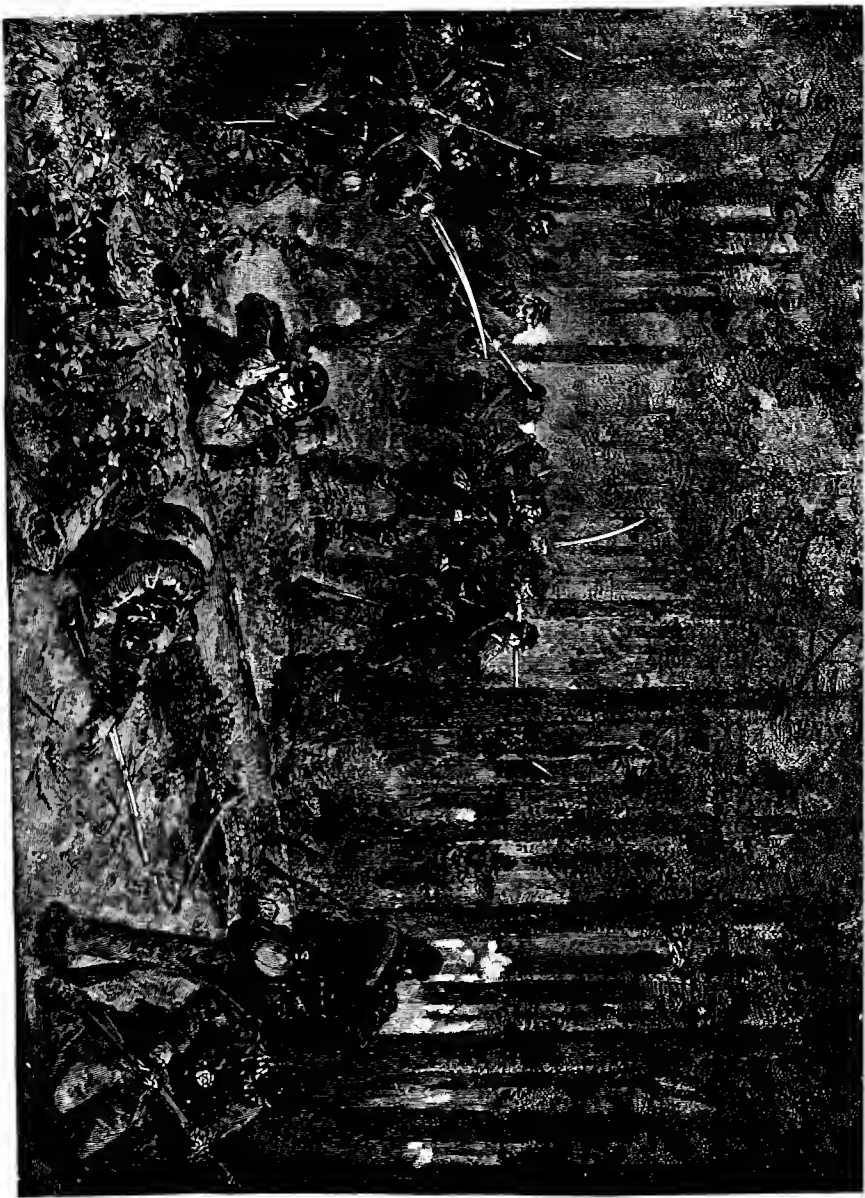
ADVANCING TOWARDS THE FENCE AT MILL SPRINGS.