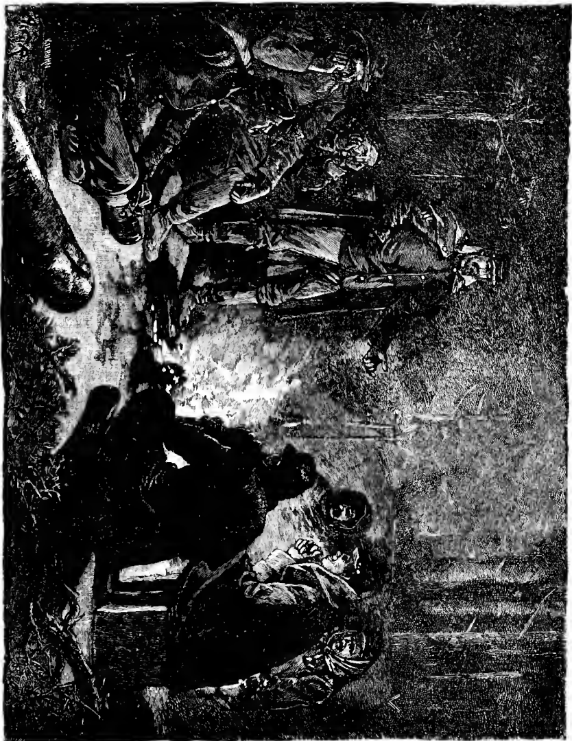
CHRISTMAS EVE AROUND THE CAMP-FIRE AT SAVANNAH.