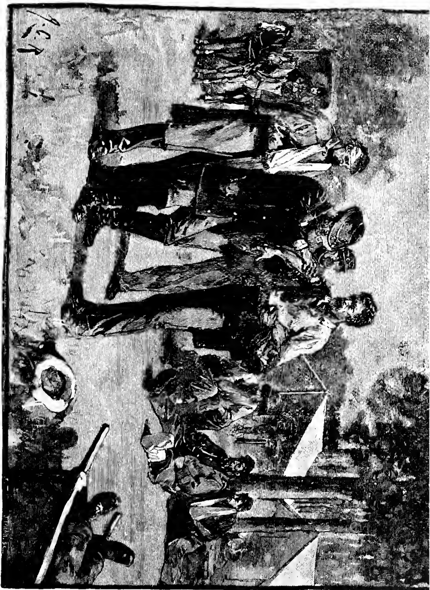
A SCENE IN THE CITY OF BANGOR