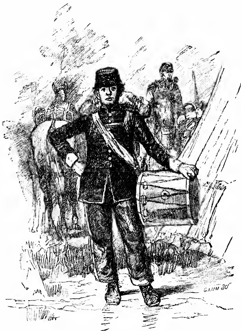
READY FOR THE FRONT.